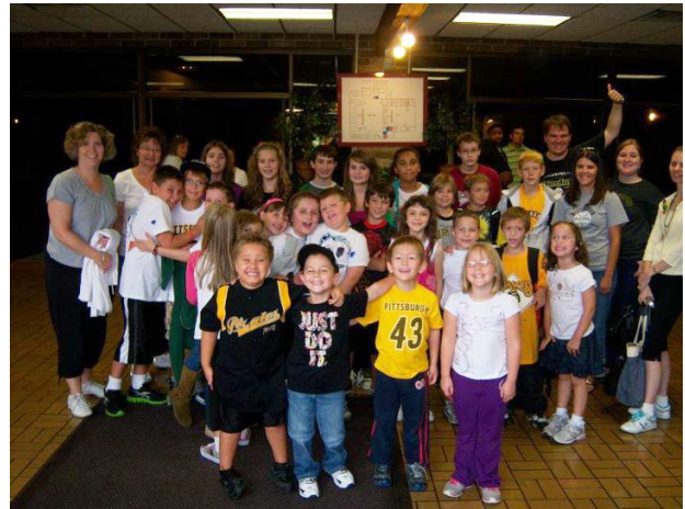
CFA is going to the Pirate game!

grown ups started to get snacks, then everyone did.